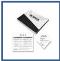
User's manual Quality Certificate Warranty Card