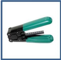
Wire stripping pliers